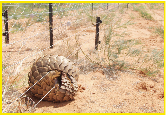
Photo 1. Temminck's Ground Pangolin (Smutsia temminckii) entangled in an electric fence line

Road mortalities. During a 4-year study, seven road mortalities were recorded along an approximately 50 km stretch of the N14 highway in the Northern Cape Province and at least a further four mortalities were recorded on this same stretch of road in the preceding five years (Pietersen 2013; Pietersen et al. 2014a). Extrapolating this along an estimated