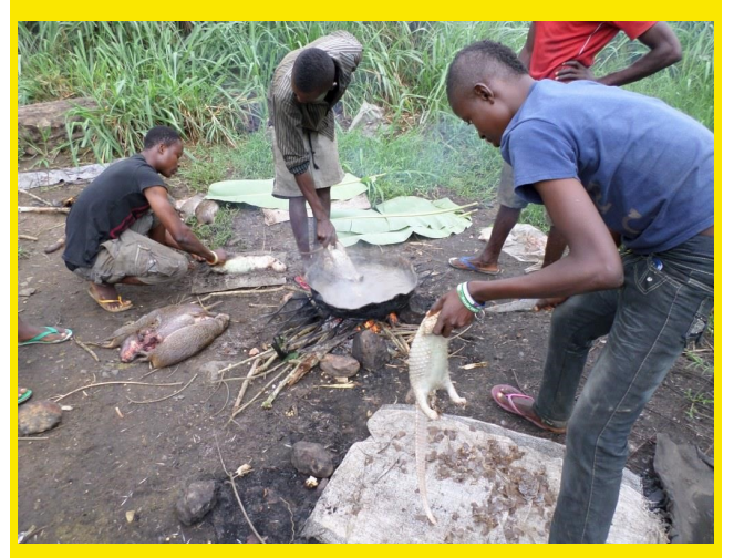
Photo 2. Temminck's Ground Pangolins (Smutsia temminckii) are widely used for bushmeat

8,065 km of roads across its range, there are an estimated 280 pangolin deaths on roads per year. The exact extent of this threat is difficult to quantify due to persons removing carcasses from roads for muthi and bushmeat, and for the novelty factor (for example, having animals stuffed for display). The severity level is believed to be relatively low at present, but this should be monitored.